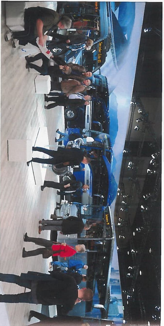
This year's Busworld will hone in on sustainability and autonomy

the 'must see' innovations present in the Busworld exhibition. A shortlist will be communicated at the beginning of September.