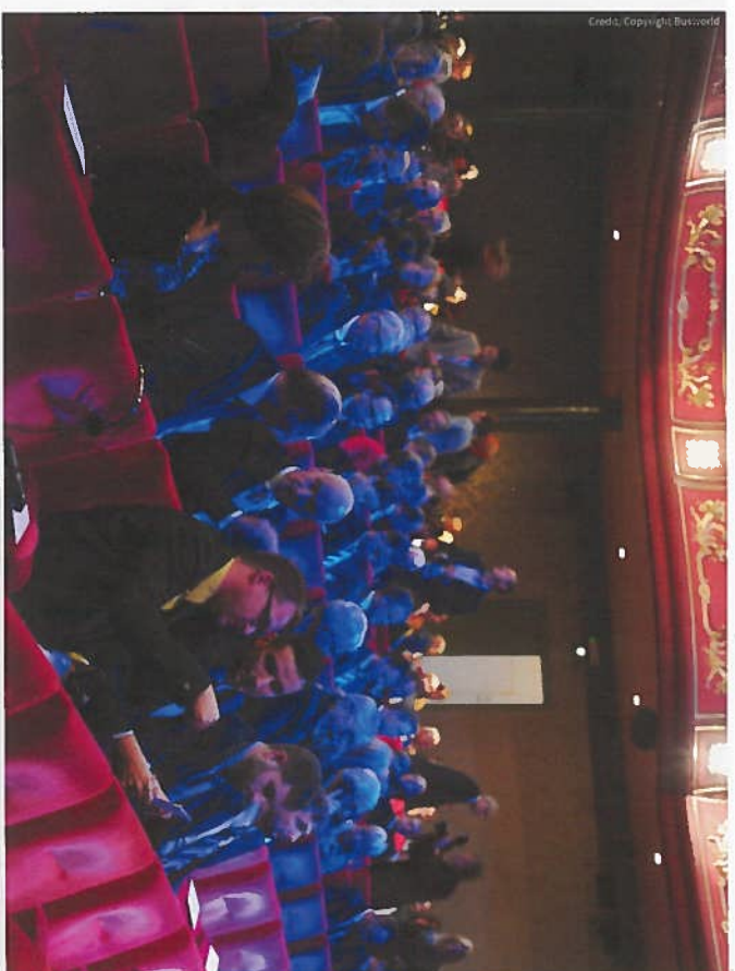
The Busworld Awards will be presented the night before the exhibition opens