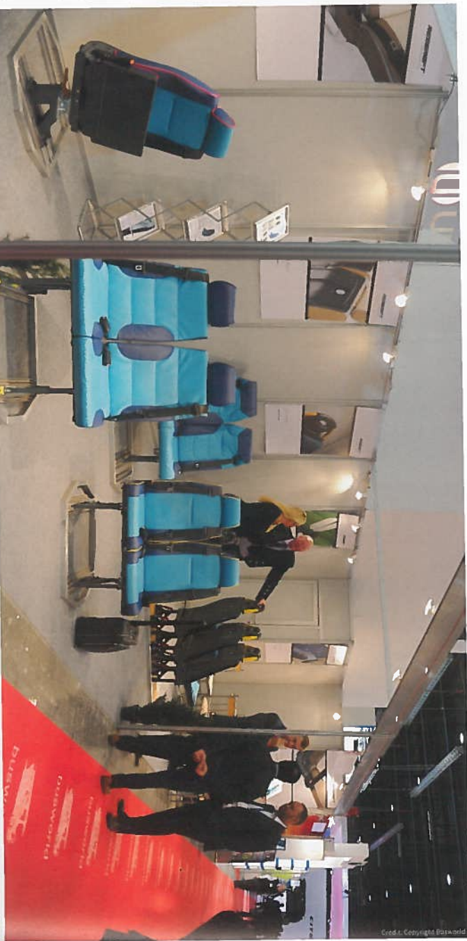
Busworld Kortrijk 2017 marks the last time the event will be held in Kortrijk ahead of a move to Brussels in 2019

leading coach operators, city representatives and authorities to discuss the present and future challenges and opportunities of the coach sector. The discussions will revolve around three main themes: 'The Coach and the City', 'The Coach of the Future' and a vision for 'Coach Travel and Tourism in 2030'.