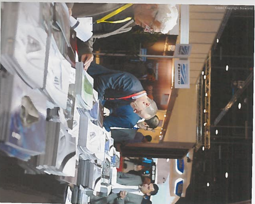
The waiting list for Busworld Europe 2017 includes more than 80 exhibitors, hence the decision to move to Brussels in 2019

events. The two-day conference (23-24 October) will highlight the major trends and developments affecting the bus industry, from connected and autonomous buses to the rollout of clean electric bus fleets. A third day of sessions will be devoted to present supporting guidelines for electric bus deployment. It will address the decision making process through four key phases: if, what, when and how. The ZEUS partners will share their key achievements, first results and