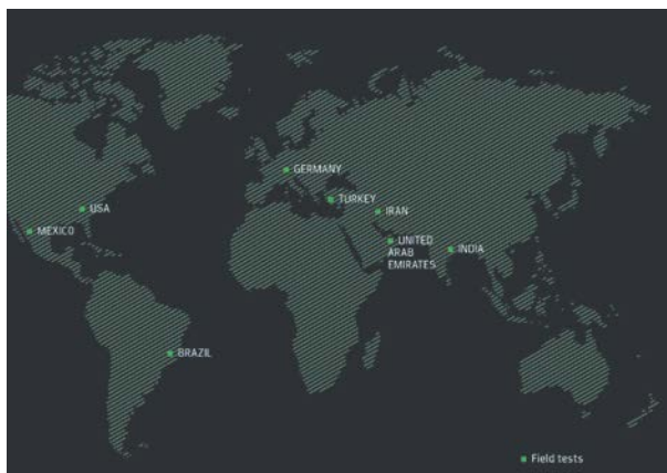
Image 2: More than 700 BITZER ROADSTAR compressors were used in a large-scale field test in the US, India, Mexico, the United Arab Emirates, Turkey, Iran, Brazil, Asia and Germany.