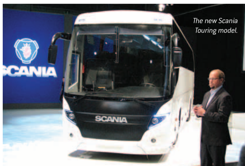
The new Scania Touring model.

With its new Touring model, Scania is launching a completely new, integral lines of travel coach lines as a world first. The Scania Touring was designed by the specialist design team based in the Swedish town of Södertälje and is being built by the Chinese Higer company. With 12 metres in length, the Scania Touring comes with a 13 litre 400 hp Euro 5-EGR engine and Opticruise gearbox. The new model is being positioned and commercialised as an integral Scania travel coach.