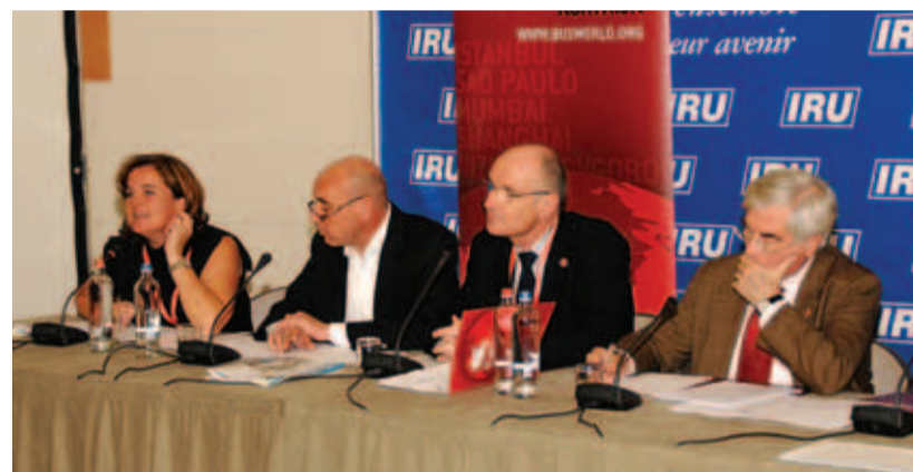
The Busworld organisers are expecting a successful 2009 edition.

The salon's central topic is the environment, with a considerable focus of attention going out to alternative fuels and ditto powertrains to name but two. As such, the salon is set to showcase the first bus powered by fuel cells as its powertrain. In doing so, the Busworld exhibition affirms its position as a worldwide platform for the transport of passengers by bus. Busworld is firmly keeping its finger on the pulse in spotting and drawing attention to bottlenecks and providing solutions in response.