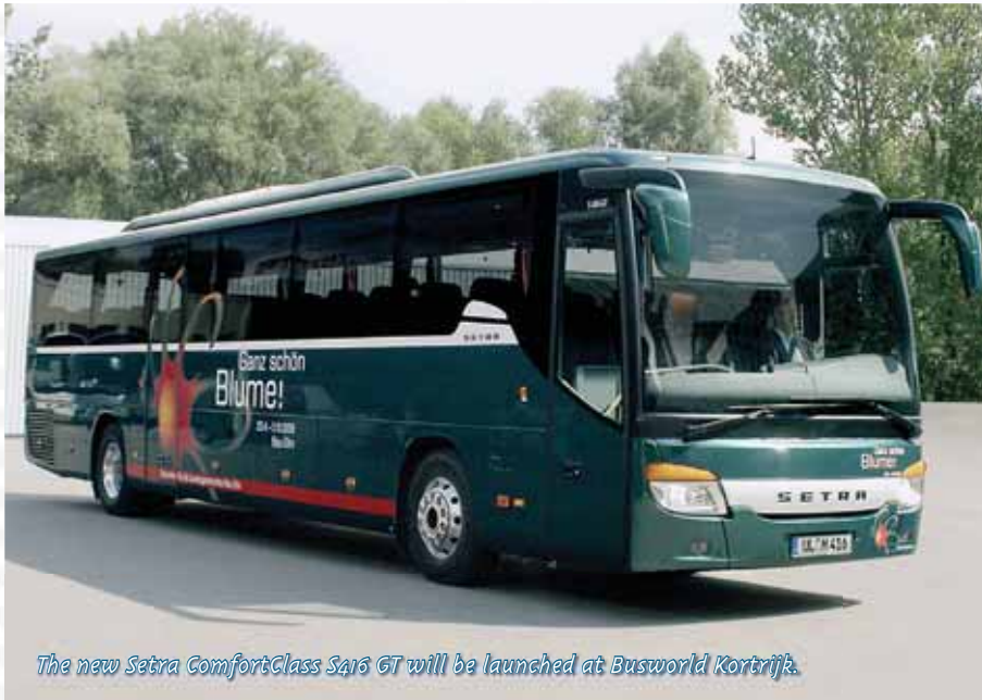
The new Setra ComfortClass S416 GT will be launched at Busworld Kortrijk.

On 19 October, the fifth European Bus & Coach Forum will be held in one of the meeting rooms in Kortrijk Xpo. It is being staged jointly by the International Road Transport Union (IRU), the United Federation of Travel Agents' Association and the European Tour Operators Association. The theme will be "Coach Travel: The Green and Safe Alternative". The forum is being organised in partnership with Busworld Kortrijk.