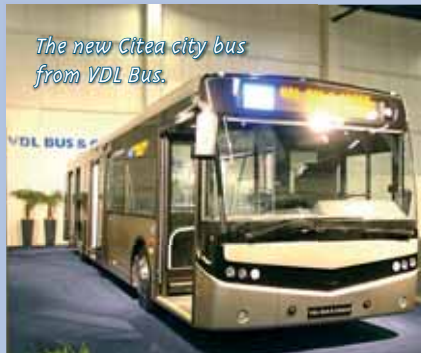
The new Citea city bus from VDL Bus.

VDL Bus & Coach will show a selection of 15 vehicles and chassis modules on its large stand in hall 4. There will be world premieres for the Futura FLD104-365, a 41-seat, lower deck, version of the Futura range that recently celebrated its 25th anniversary. Also totally new will be the Picardie luxury midicoach, based on a Mercedes-Benz Vario 818 chassis.