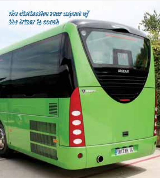
The distinctive rear aspect of the Irizar i4 coach