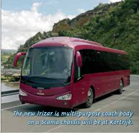
The new Irizar i4 multi-purpose coach body on a Scania chassis will be at Kortrijk.

In the European bus and coach industry, Scania sees the strongest growth in the interurban sector. Two new models have been developed. The Irizar i4 range is available with optional floor heights and at various lengths up to 15 metres. For Nordic markets, Scania has worked with