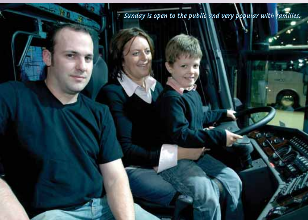
Sunday is open to the public and very popular with families.