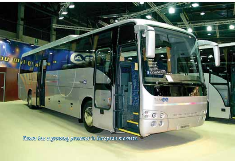
Temsa has a growing presence in European markets.