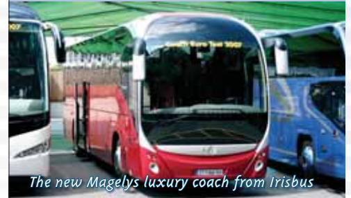
The new Magelys luxury coach from Irisbus

Irisbus will occupy a large part of Hall 3 at Busworld Kortrijk. Their most important exhibit will be the new Magelys coach which replaces the long-running Iliade range.