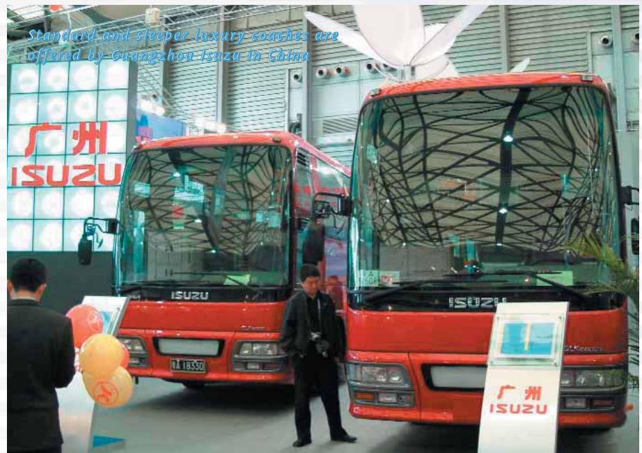
Standard and sleeper luxury coaches are offered by Guangzhou Isuzu in China

There is an equally wide range of coaches, starting with simple mid-sized vehicles for local work. These can have either front or rear mounted engines and simple steel suspension.