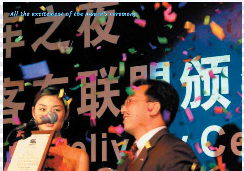
All the excitement of the Award's ceremony

The exhibition facilities at Pudong are among the best in the world. Later this year, a high-speed magnetic train service will run between Pudong International Airport and Shanghai city centre. There will be a stop on the line, just across the street from the exhibition centre. The provisional dates for Busworld Shanghai 2004 are 17, 18 and 19 March, but we will keep you informed in future editions of the Busworld newsletter.