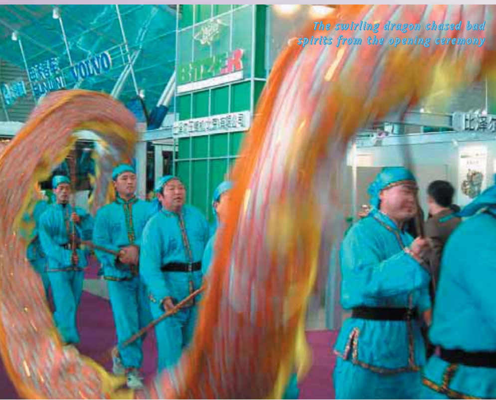
The swirling dragon chased bad spirits from the opening ceremony

At the parent Busworld Kortrijk exhibition, perhaps the most important reason to attend is to meet existing customers and win new ones. Contact is more important than product. Hopefully, given time, Chinese manufacturers will come round to the same viewpoint and attend Busworld Shanghai every year.