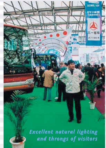
Excellent natural lighting and throngs of visitors

However, it is the Medium (7-10 metre) and Large (over 10 metre) sectors that, in percentage terms, are growing at the fastest rate. In 2001, Chinese manufacturers built around 59,000 buses and coaches